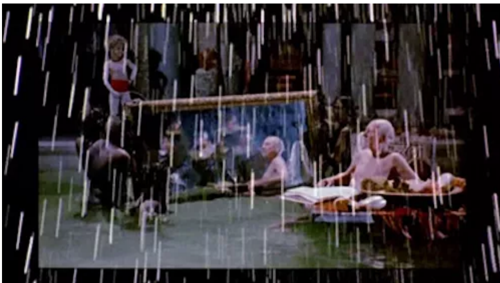
Peter Greenaway Prospero's Books Mirrors unfolding Prospero's creations. The storm and the crew

A difference in diegetic time is thus encoded between Prospero as a story-teller illustrating the tragic events with 'tableaux' for Miranda to see the past world of his memories (DVD 00:17:32 and following), and his plan as a magician when he causes the storm to occur and then relents by initiating a life of happiness for Miranda (according to Greenaway and to commentators of the play, we move from a 17 th century Jacobean revenge tragedy (Act I, II, III) to a romance of reconciliation in act IV and V). [44]