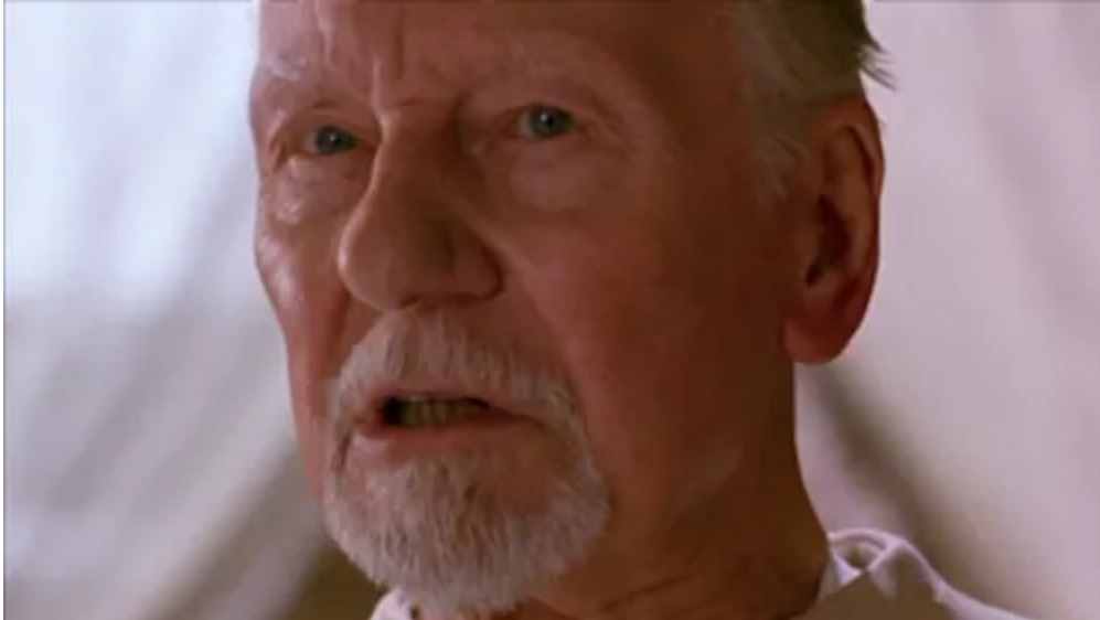
Peter Greenaway Prospero's Books The triad: Gielgud as Shakespeare/Prospero/Greenaway

Found Footage cinema. Surveillance footage is also present in the overall motif of surveillance, which characterizes Prospero's relation to other inhabitants of the island who are creations from his mind, such as the four Ariels.