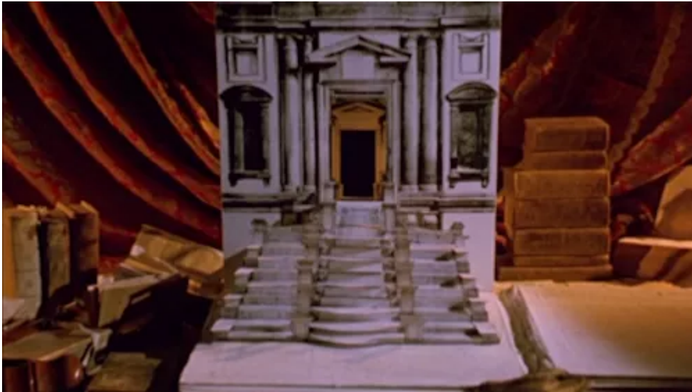
Peter Greenaway Prospero's Books Paintbox unfolding architecture